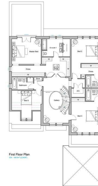
First Floor Plan Scale: 1:100 (0.1:1)