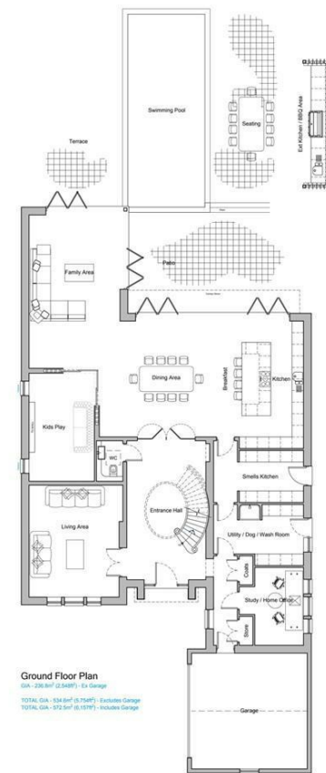
Ground Floor Plan Scale: 1:100 (0.1:1) - Includes Garage TOTAL G.A. - 532 Sq Ft (5,794 Sq Ft) - Includes Garage TOTAL G.A. - 512 Sq Ft (5,517 Sq Ft) - Includes Garage